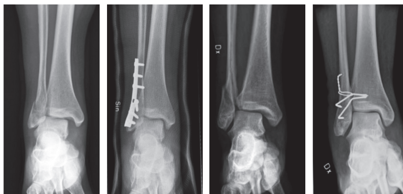
Figure 2. Typical fractures and treatment with the AO method (left panels) and the Cedell method (right panels).

Classification of ankle fractures was done using the AO/Weber classification