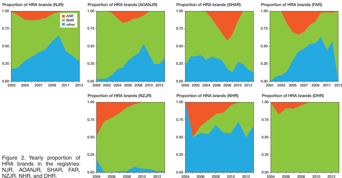
Figure 2. Yearly proportion of HRA brands in the registries: NJR, AOANJR, SHAR, FAR, NZJR, NHR, and DHR.

The trend in the use of the BHR was similar across AOANJR, NJR, SHAR and FAR (Figure 2). In the 3 other registries variable patterns were seen. The proportion of other HR designs, especially the ASR HRA, increased rapidly from 2004. However, in 2010 the proportion of BHRs started to rise and the use of ASR came to an end due to the recall in September 2010.