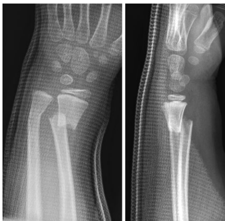
Figure 1. Case 1: a 5-year-old girl who fell off a swing and sustained a completely displaced distal radius fracture with shortening and a non-displaced but slightly angulated fracture of the distal ulna.