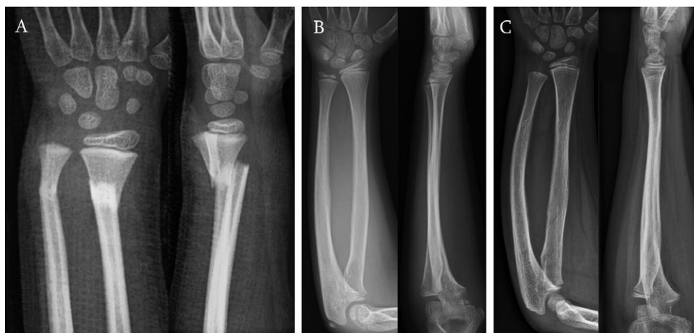
Figure 4. A–C: all 3 patients' fractures were immobilized in bayonet position (A) without reduction with synthetic dorsal above-elbow and volar below-elbow splints applied in finger-trap traction without anesthesia in the emergency department. Splints were removed at 4 weeks. Radiographs at 3.5 years from the injury in case 1 (B) and case 3 (C). Parents of Case 2 (A) did not want any follow-up radiographs taken, because their son had made full functional recovery and he had no pain.

a Fewer than 3 respondents from Armenia, China, Denmark, Japan, Northern Ireland, Mexico, Portugal, and Singapore.