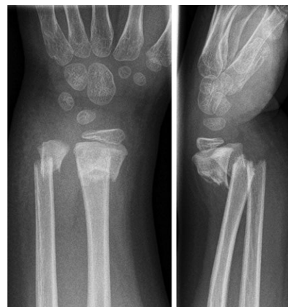
Figure 3. Case 3: a 5-year-old boy who fell off a climbing frame sustaining completely displaced and shortened fractures of both radius and ulna with angulation.