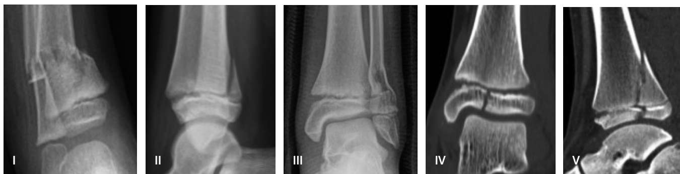
Figure 1. The Peterson fracture classification.