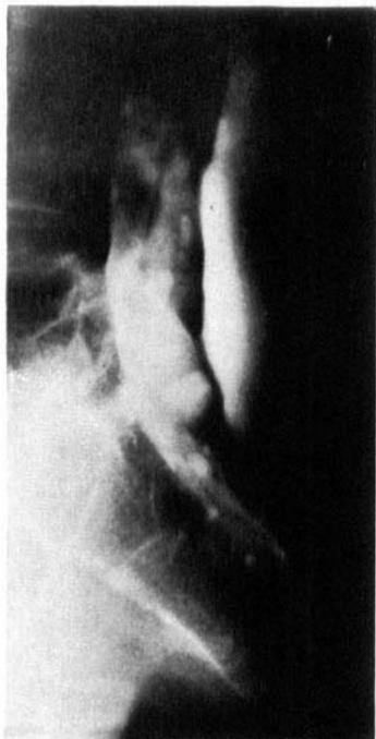
Figure 1. Case 1. Lumbar myelogram demonstrating an extradural lake of contrast.

left foot and its two lateral toes was revealed. Lasègue's sign was negative on both sides. Conray myelography showed a massive contrast filling behind the dural sac (Figures 1-3).