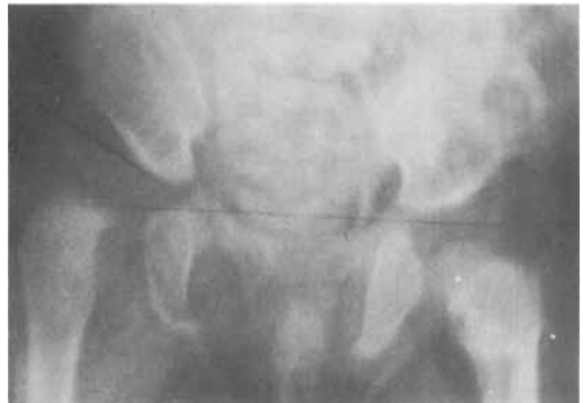
Figure 5. Girl 5.5 months. Dislocation of the contralateral hip which was originally missed.

It is interesting that in four of our babies there was an early appearance of the ossific centre of the head of the femur (less than 8 weeks, the earliest being 20 days) on the affected side (Figure 3). The same was noted in one of the cases reported by Michail et al. (1958). A possible explanation for this may be the increased blood supply of the area after the injury. Equally interesting is the association of this injury with congenital dislocation of the hip. Two of our cases had CDH and one of the two cases reported by Michail et al. had subluxation of the contralateral hip (Figure 5). It is possible that the sudden and violent stretching of the capsule of the hip joint due to forced traction at delivery may be a pre-