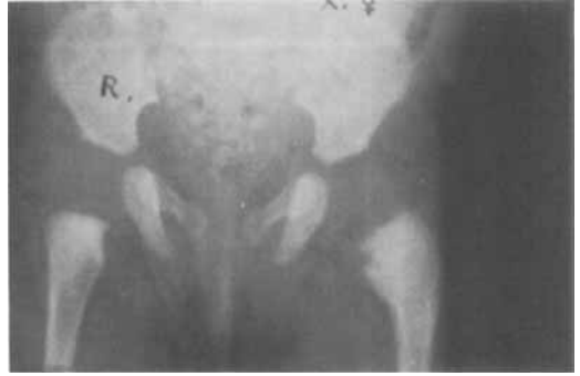
Figure 8. The appearance of the callus is indicative of the displacement and the intact periosteum on the medial and posterior aspects.

With regard to treatment, various methods have been described by a number of authors. It appears, however, that no specific treatment is necessary, since many cases are diagnosed after