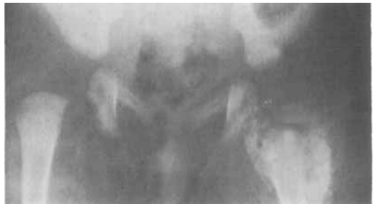
Figure 3. Large ossific centre of the capital epiphysis is present on the affected side at the age of 25 days (same patient as Figures 1 and 2).