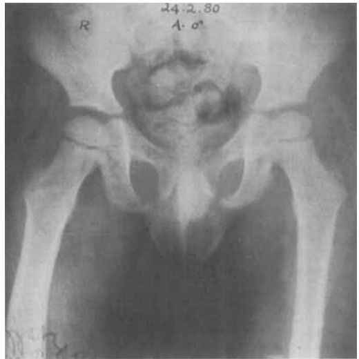
Figure 9. X-rays showing the varus angulation migrating peripherally.

Avascular necrosis of the femoral head was not seen in our cases and as far as we know has not been reported in the literature. The anatomy of the epiphysis of the upper end of the femur at birth and the position of the epiphyseal vessels