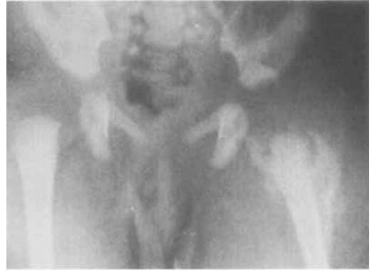
Figure 2. Same patient as in Figure 1. At 2 weeks of age there is already massive callus extending down to the mid-shaft of the femur.

In the first few days of life the X-ray findings were those of varying lateral and upward displacement of the shaft of the femur (Figure 1). Usually after the second week callus formation was obvious on X-ray. This callus in some cases extended down to the mid-shaft of the femur (Figure 2). In one baby a supracondylar fracture of the same femur was also present whereas another