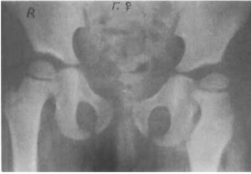
Figure 4. Same patient as Figures 1, 2 and 3 at the time of the final assessment. Valgus deformity of the femoral neck; otherwise a normal hip.