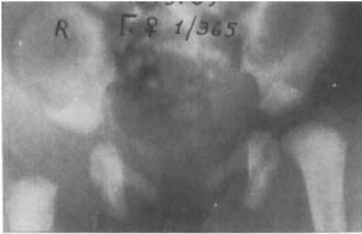
Figure 1. Anteroposterior and lateral X-rays of a 1-day-old girl showing upward and anterior displacement of the shaft of the left femur.

baby had a fracture separation of the lower femoral and upper tibial epiphyses of the same limb. In four out of the six patients the ossific centre of the femoral head appeared early on the affected side and in one baby in particular it was present at the age of 20 days (Figure 3).