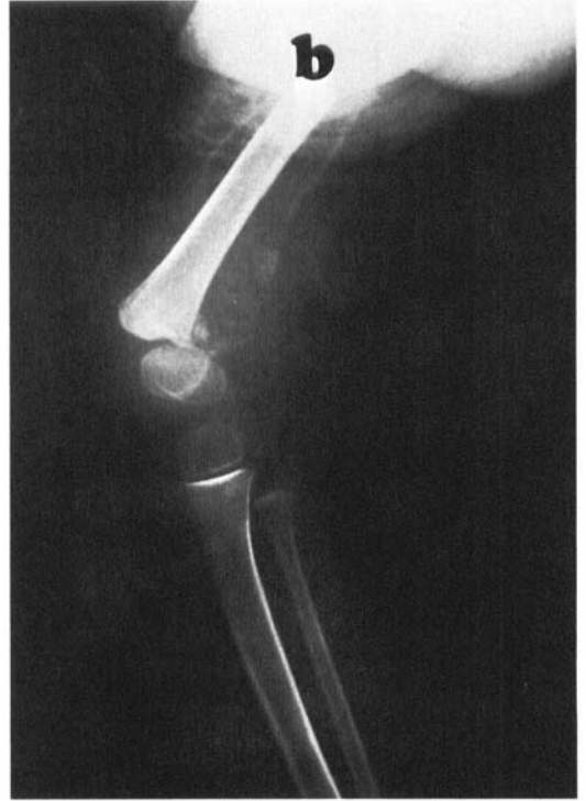
Figure 1. Roentgenographs showing the displaced distal femoral epiphysis with a typical ossifying subperiosteal hematoma.