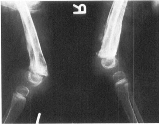
Figure 4. Lateral view of both knees showing good position of the epiphysis and sclerosis of adjacent metaphyseal bone.

connective tissue; because no collagen is formed, the structural strength is decreased and the stress of weight-bearing or muscular tension may produce physiolysis. Stability depends upon the calcified cartilagenous matrix which is not an adequate substitute for normal bone. The poorly formed capillaries rupture