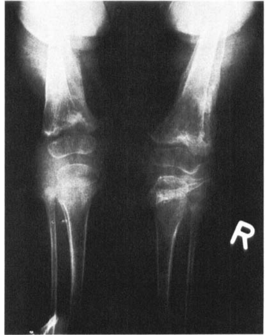
Figure 3. Antero-posterior film showing the epiphysis in good alignment.