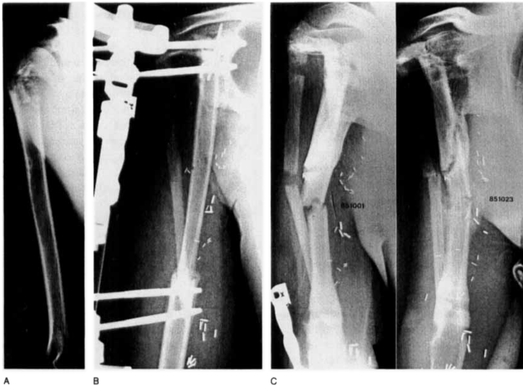
Figure 3. Case 6. Osteosarcoma with fracture of the proximal humerus in a 13-year-old boy.