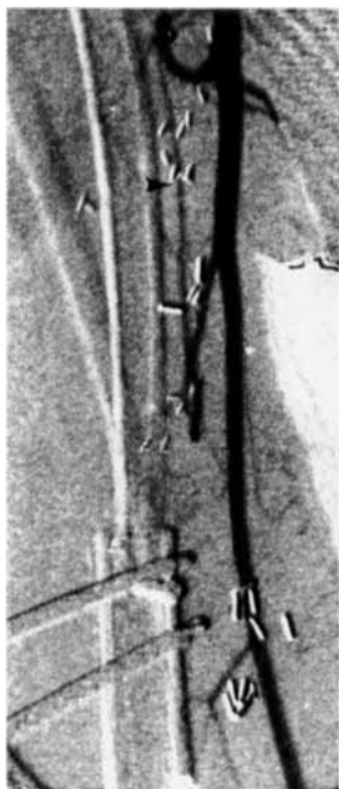
Figure 1. Case 6. Digital microangiography with intravenously administered contrast visualized the peroneal artery (arrow) running parallel to the graft. Lateral to the vascularized graft, a nonvascularized tibial graft can be seen.

with radiotherapy (Krag et al. 1982). All the patients were given prophylactic antibiotics.