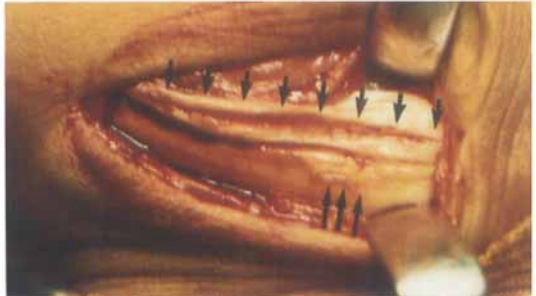
Figure 2. The 4-cm longitudinal rupture of the peroneus brevis tendon (small arrows) and a small longitudinal tear in the peroneus longus tendon (long arrows).