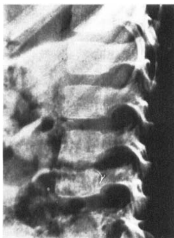
Acute stage of spondylodiscitis in a 2.9-year-old girl.