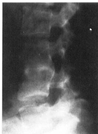
19 years later, block vertebra with stenosis of vertebral canal.

eral view, compared with the diameter of the canal one level higher (Figure 2). 23 patients had a kyphosis at the level of the affected disc space. In 13 cases there was a lateral curve, in 4 cases of more than 10°. In 2 cases we found an unrelated transitional vertebra L5.