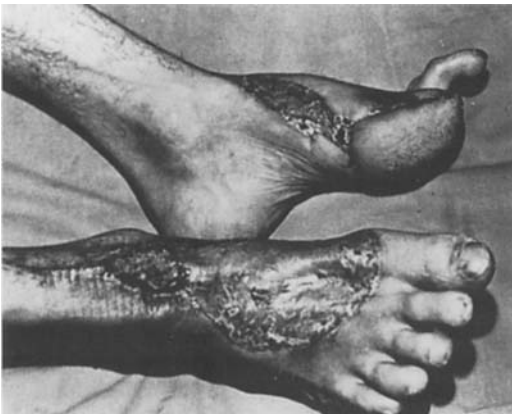
Appearance of the donor site and the reconstructed big toe

flaps, such as the scapular, dorsalis pedis (Figure 2), rectus abdominis and the groin flap, were used in 1 case each (Table 1). The posterior or the anterior tibial vessels and the saphenous veins were used as recipient vessels, depending on the location of the defect. End-to-end or end-to-side anastomoses were used for arteries and end-to-end anastomoses were always used for veins. The sural nerve was used as a recipient nerve for suturing with the lateral cutaneous nerve of the radial forearm flap in 2 cases (Cases 12 and 15) to provide protective sensibility of the heel area. Immediate reconstruction was performed following all tumor resections and in the case (Case 2) with an opened knee joint. No regular anticoagulants were used in this series, with the exception of Cases 2 and 5 who were associated with severe avulsion injuries.