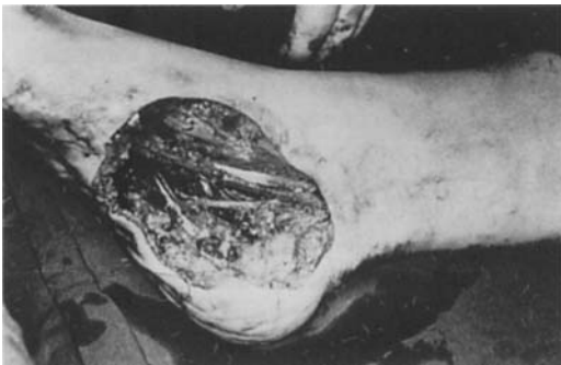
Figure 1. Case 14.

The defect following wide local resection of a hemangiosarcoma on the right foot.