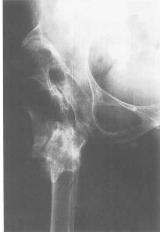
Figure 1. Preoperatively. High congenital dislocation of the right hip associated with a subtrochanteric pseudarthrosis.

The wide spectrum of pathologic anatomy found in a dislocated hip makes its treatment with a total hip replacement difficult (Hartofilakides et al. 1988, Xe-