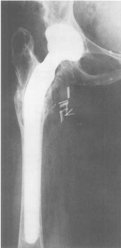
Figure 3. 2 years after surgery.

correction were complex. The main problems included: 1) correct placement of an optimally-sized acetabular component at the true acetabulum, 2) derotation and shortening osteotomy at the level of the subtro-