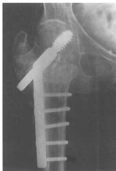
Figure 1. Femoral medialization occurring in a trochanteric fracture, in which the lag screw was inserted directly into the fracture site. The distal femur has displaced medially, reducing the area of bone-to-bone contact at the fracture site and the lag screw has run out of slide.

Fractures were subdivided into 7 types (Figure 2). For the purpose of this study, the term pertrochanteric