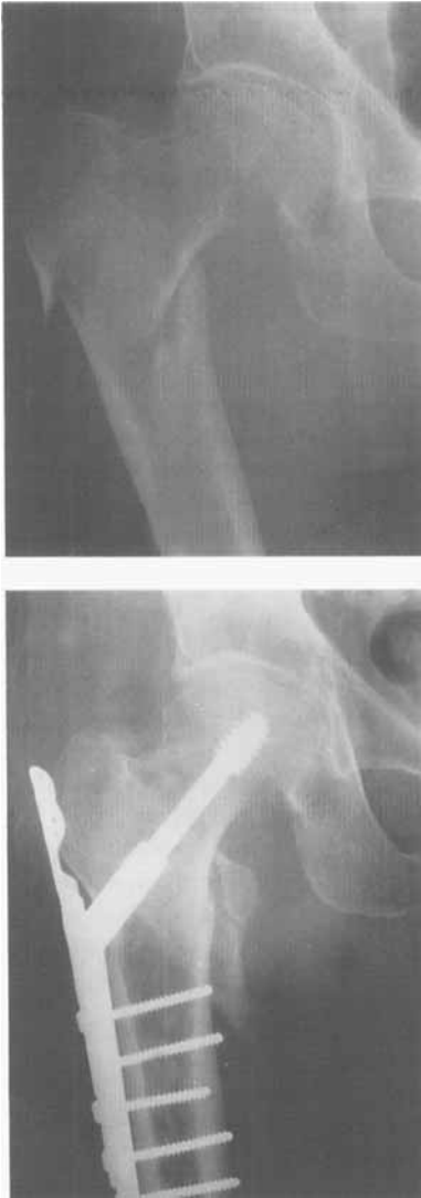
Figure 5. An intertrochanteric fracture where the fracture line is at the level of the lesser trochanter. A SHS supplemented with a trochanteric stabilizing plate has been used which prevents any medial displacement of the distal fragment by resting against the greater trochanter.

ment osteotomy. Medial displacement osteotomy has been used with the SHS fixation of trochanteric fractures and found to be detrimental, with a greatly increased risk of fixation failure (Nunn 1988, Gargan et al. 1994). Our study provides further evidence of the potential disadvantages of medial displacement osteotomy.