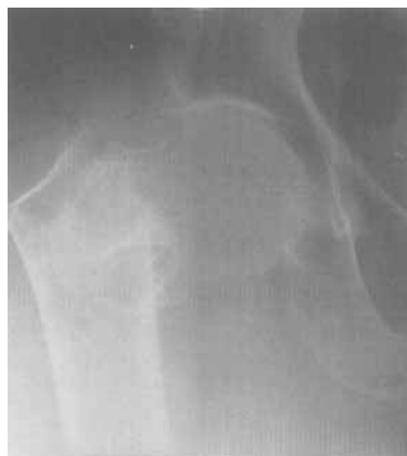
Figure 4. An intertrochanteric fracture in which there is comminution of the lateral femoral cortex at the site of insertion of the lag screw.

Direct insertion of the lag screw into the fracture site occurred in most transtrochanteric fractures and