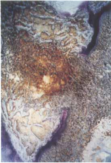
Figure 1. Right greater trochanter specimen 1 month postoperative. Bone tissue has developed filling the entire hole across the growth plate (Toluidine blue \times 40 ).