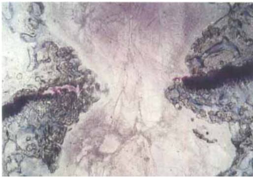
Figure 3. Left greater trochanter specimen 2 months postop. Peripheral SR-PGA screw degradation allowed some bone formation from both sides of the growth plate, across the physis (Toluidine blue \times 100 ).