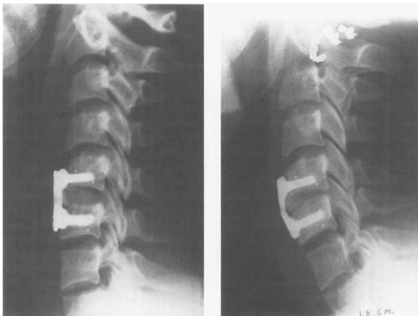
Figure 3. Postoperative radiograph of a patient who developed pseudoarthrosis (left). Same patient, 6 months postoperatively (right).

Clinically, there was no difference in arm pain ( p = 0.4 Mann-Whitney-U test) or neck pain ( p = 0.6 Mann-Whitney U-test) at the 2 year follow-up between the 2 groups (Table 5).