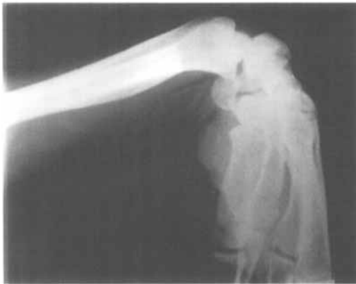
Figure 2. On the lateral radiograph of the flexed wrist, a dorsally subluxated lunate can be seen.