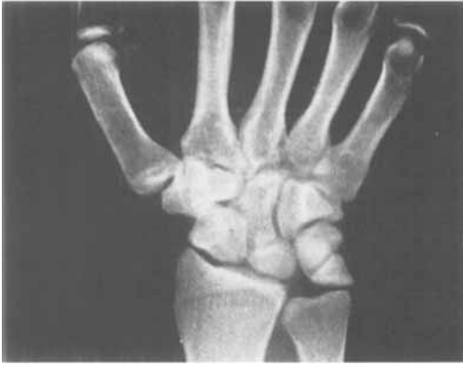
Figure 1. A. Three congenital accessory bones.