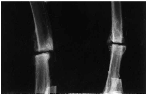
C. Anteroposterior and lateral radiographs showing non-union of the ulna 6 weeks after osteotomy in a rabbit treated with prednisone.

al. (1952) (intramedullary pin placement) and Weiss and Ickowicz (operative fracture with scissors) used minimal trauma, there was greater fracture stability, and consequently less cartilage was formed. Finally, rats may not be a good species in which to study the effects of glucocorticoid, since they do not consistently respond to such treatment with bone loss and have a different endogenous