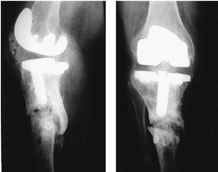
Figure 3. After union in the 60th postoperative month.

were begun. Radiographic union occurred after 5 months and the fixator was then removed. At the latest follow-up, 5 years after the removal of the frame, the patient had no pain and 115° of active knee motion (Figure 3).