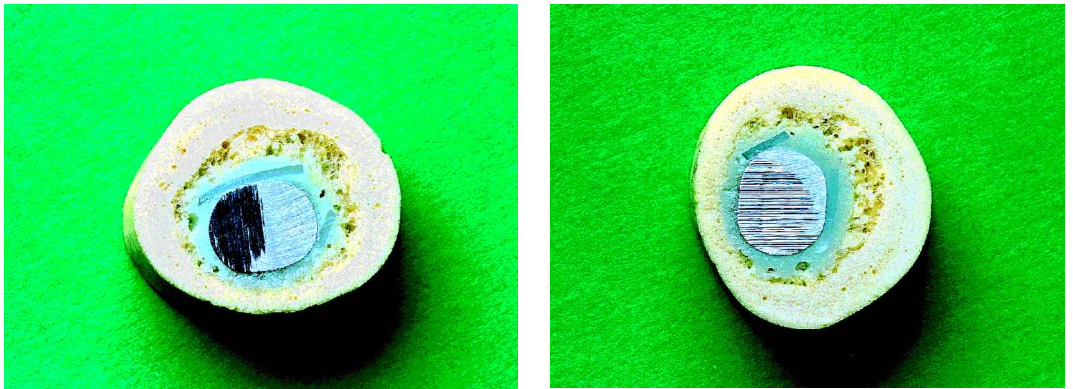
Figure 2. Cross-sections of the femur. The pictures show how the wing pieces from the Hardinger plug interfere with the cement-stem interface.