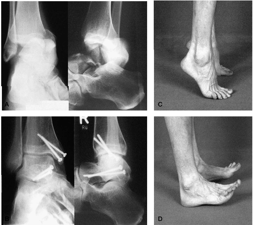
Figure 1. A. Primary open defect fracture of the talar neck Hawkins type III and a medial malleolus fracture. B. 5 years after accident. C and D. Free range of motion in ankle and subtalar joints. Good results according to the Hawkins (12 of 15 points) and Mazur scores (89 of 100 points).

19/79 patients were very satisfied with the outcome at the follow-up. 33 patients were mostly satisfied, and 17 moderately satisfied,