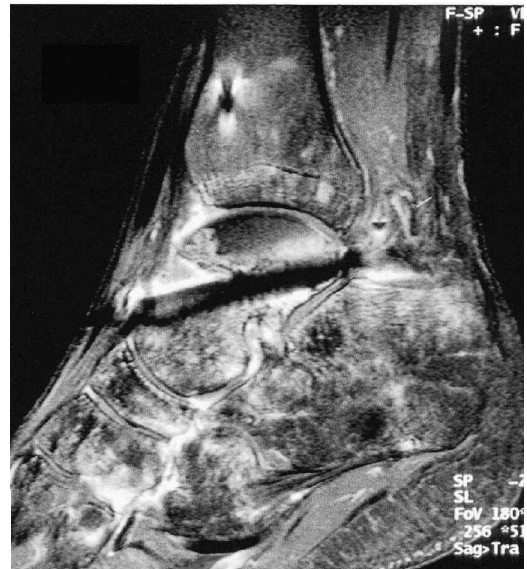
Figure 2. A. Hawkins type III talar neck fracture shows dorsal luxation of the corpus tali and a medial malleolus fracture.

B. 13 months after osteosynthesis using continuous threaded screws for the talar and medial malleolus. Talar corpus necrosis can be seen in both projections with no sign of fracture consolidation.