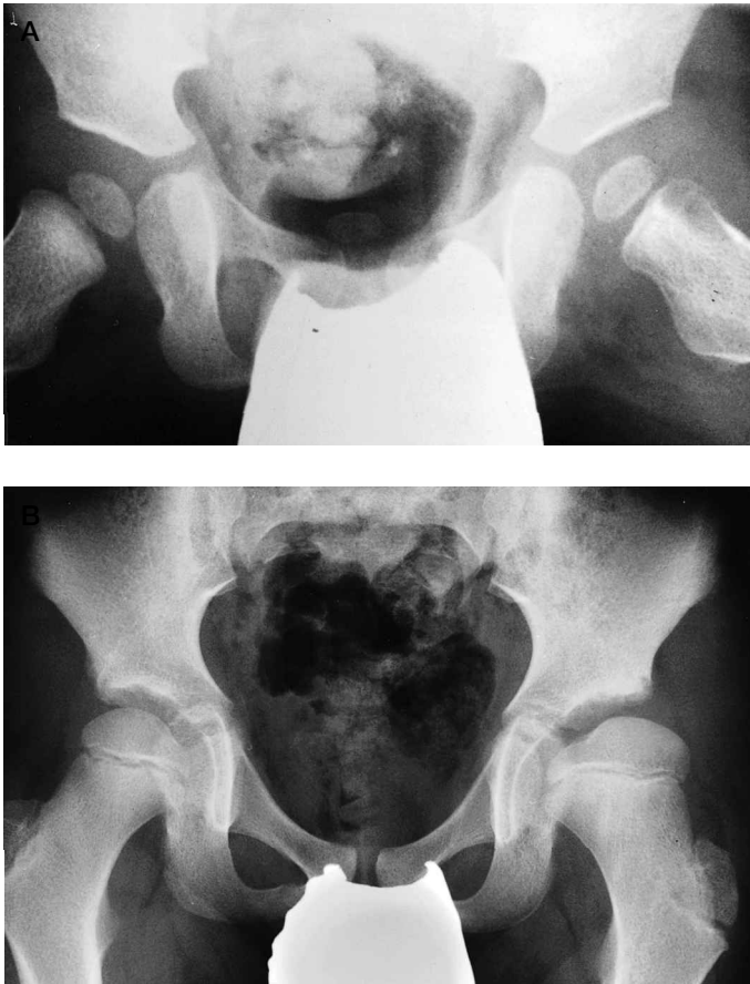
Figure 2 (case 10).