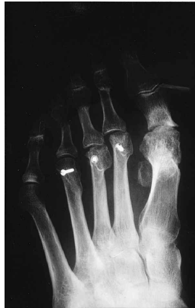
B. The same patient at the 2-year follow-up. A Chevron osteotomy with a Keller-Brandes revision had been performed in addition to the Weil osteotomy 2-4. She has no pain.

cated MTP joints were reduced after a Weil osteotomy.