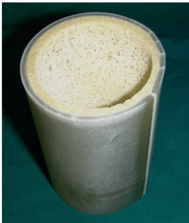
Figure 1. The synthetic acetabulum model with a central cavitory defect. The porous structure is clearly visible.

We inserted 3 clusters of 3 markers at standard locations in the iliac, ischial and pubic bones. The human cadaveric pelvic bones were placed underneath the MTS loading device at 45 degrees abduction and 0 degrees anteversion of the cup, so that the direction of the load displaced the cups superiorly and medially into the largest thickness of the grafts layer. Dynamic loading was applied at a frequency of 1 Hz in four stages, starting at 0–750 N with further staged increments of 750 N up to 0–3000 N at the last stage. Each stage lasted 900 cycles. To permit elastic and time-dependent recoil of the grafts, we also studied the migration of the cups after unloading and 15 minutes after unloading. At the beginning and at the end of each load increment, RSA exposures were made at a static load to measure cup migration. Migration of the gravitational center of the 8 tantalum cup markers was taken to represent the migration of the implant relative to the bone. We used the vectorial length of the translation in 3 directions.