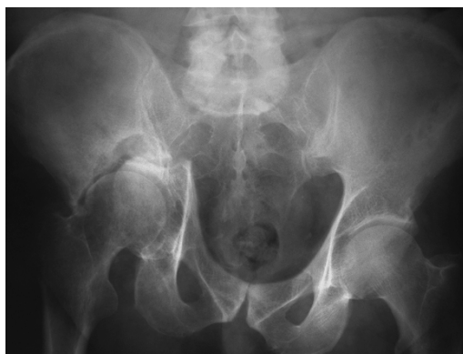
Figure 1. Preoperatively, advanced metastatic destruction of the right acetabulum with a pathological fracture and medial and cranial dislocation of the acetabulum.

In April 2001, the patient presented with an advanced right periacetabular fracture (Figure 1). A periacetabular reconstruction and a total hip arthroplasty was performed. A reinforcement cage (Burch-Schneider, Protek, Switzerland) was combined with a cemented standard stem with a 28-mm metal ball head and cemented polyethylene inlay. After reduction of the fracture, structural continuity was achieved and reinforced with 3 Steinmann pins using the compound osteosynthesis technique, i.e. the pins were entirely covered with bone cement, which filled the gap. 1 pin was inserted from the superior iliac crest to the cranial part of the acetabulum, and 2 pins through the center of