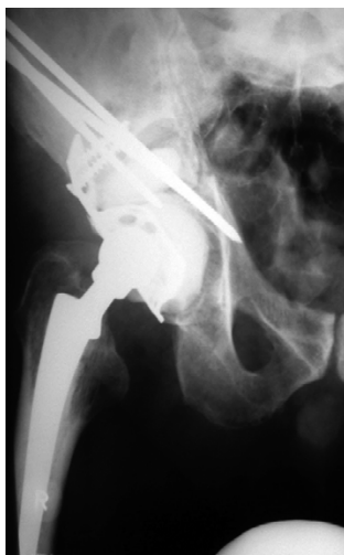
Figure 2. Periacetabular reconstruction with modified Harrington technique and total hip replacement. Unthreaded pin is marked with an arrow.