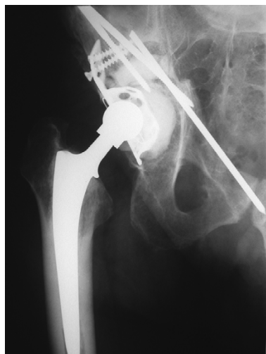
Figure 4. The migrated pin projecting into the pelvic cavity.