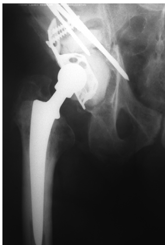
Figure 3. Six months postoperatively: note the appearance of the most medial pin projecting beyond the medial acetabular border (marked with an arrow). There was no definite pin migration at that point.