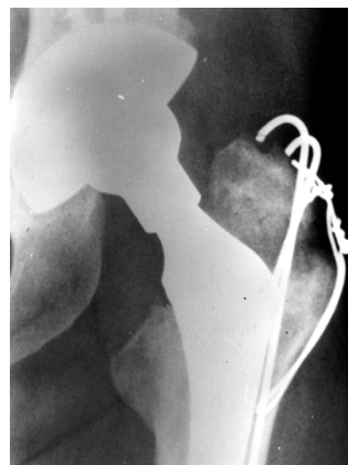
Figure 3C. A 2-year postoperative radiograph showing that the bone graft had incorporated and the fracture had healed.

mized as less than or greater than 8 mm. It is well known that in a metal-backed prosthesis, polyethylene stress increases rapidly as the polyethylene thickness falls below 8 mm (Bartel et al. 1986).