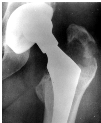
Figure 3B. 3 months later, the same patient experienced sudden lateral hip pain after a minor strain. The radiograph showed a displaced fracture through the cyst. She underwent surgery to fix the fracture, bone graft the cyst, and revise the metal shell and the liner.