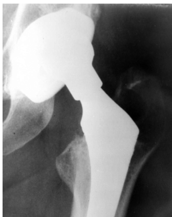
Figure 3A. Anterior/posterior radiograph of a 51-year-old woman taken 7 years after THA, and before the fracture, shows an osteolytic cyst on the greater trochanter and severe polyethylene wear.