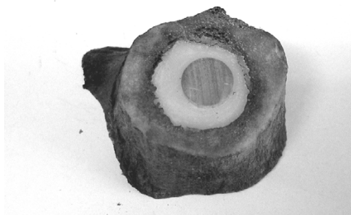
Figure 1. One of the specimens. Note the circular cross section of the aluminium rod.

The specimens were then sectioned into 6 pieces, using a precision water-cooled rotating diamond disk cutting device (Discotom). The first was at a level of 1.5 cm below the level of the calcar oste-