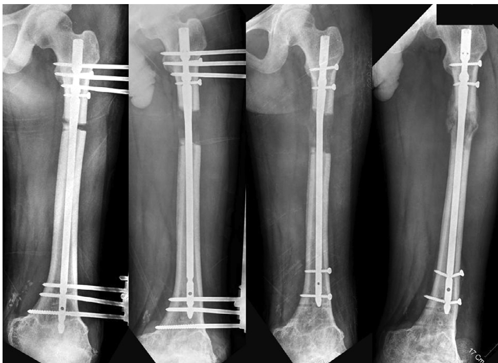
Figure 2. (case 12). Lengthening over a nail was done in an 18-year-old man. After gaining 5 cm, the external fixator was removed. 5 months after the operation, the distracted segment was slightly collapsed, with breakage of locking screws.