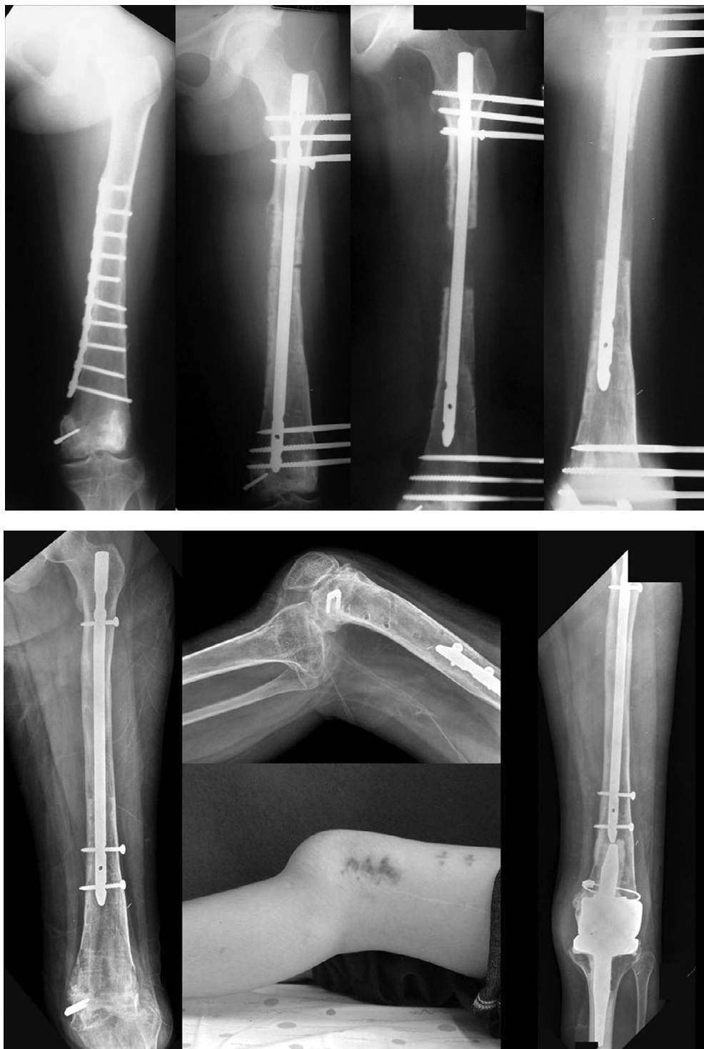
Figures 3. (case 19). The patient experienced femoral shortening after the limb salvage operation, which involved irradiation of the osteosarcoma of the distal femur. Lengthening over a nail was done, and 7.7 cm was gained. Although satisfactory lengthening was achieved, severe knee subluxation occurred with stiffness which was probably due to deficiency of cruciate ligaments. Arthroplasty was performed in this patient.