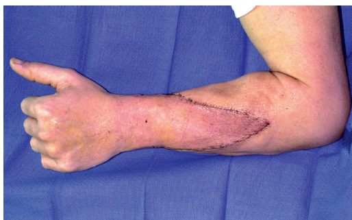
Figure 3. (a) Clinical signs of acute rejection of the skin in the second US hand transplant recipient. Note the maculopapular rash and edema in the donor allograft, in the proximal triangular area.