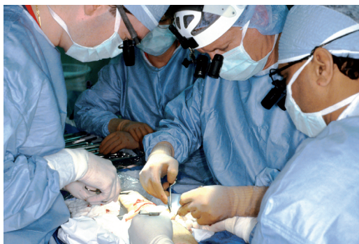
Figure 1. Doctors from Christine M. Kleinert Institute in Louisville, Kentucky, performing the first US hand transplantation in January 1999. The teams of surgeons were led by Dr. Warren C. Breidenbach III (second from the right).

preservation time may predispose to more severe rejection (Qayumi et al. 1998), the surgical procedure requires two surgical teams to minimize the cold ischemia time. One team identifies and tags the anatomical structures such as muscles, tendons, vascular bundles, nerves, and bones of the donor limb, whereas the other team simultaneously prepares the amputation stump of the recipient. The surgeon will progress with tissue repair (Figure 1) in the following order: bone fixation, arterial anastomosis, anastomosis of a few veins, tendon repair, nerve repair, and finally anastomosis of the remaining veins. The sequence may vary according to the preferences of the surgical team. Postoperatively, the patient is managed according to established guidelines for major replants.