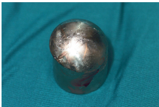
Figure 3. The femoral ball worn down to a cylinder.