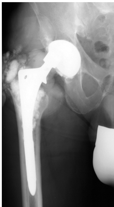
Figure 1. Deterioration of the metal head on radiographic control 3 years after revision surgery.

2 years after revision, the patient noted increasing impairment of his hearing and sight and eventually he could just recognize outlines and colors but could not read. Also, he needed a hearing aid and headphones. In addition, there was numbness in his feet, and his head and neck were affected by dermatitis.