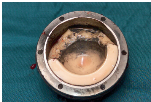
Figure 4. Smashed rim of the inlay.