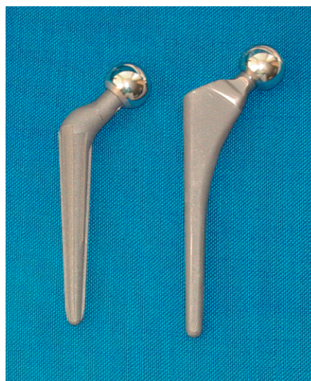
Figure 1. The Cone and Bimetric stem.

Between November 1996 and June 1998, we randomized 45 young patients with osteoarthritis to either an uncemented Cone ( n = 22 ) or a cemented Bimetric femur hip stem ( n = 23 ) (Table 1). The inclusion criteria were age under 65, unilateral osteoarthritis, and a shape of femur suitable for the Cone stem. Patients weighing over 100 kg or with any musculoskeletal disease—except osteoarthritis—were excluded. Wagner and Wagner (1995) pointed out that a trumpet-formed femur is not suitable for the Cone stem since this shape does not provide enough cortical bone contact distally.