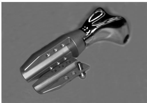
Figure 2. Rotating-hinge distal femur component connected to a hollow cylinder whose inner diameter fitted the diameter of the prosthetic femoral segment. This construct could attach to a metal-backed tibial component which allowed rotation of the prosthetic joint.

(Anspach, Lake Park, FL), the femoral segment was cut so that the remaining gap to the tibial plateau would match the size of the distal femur construct (Figure 3). The distal aspect of the prosthesis was then pulled from the tibia and a tibial osteotomy was performed as for a standard knee arthroplasty: approximately 1 cm of bone was removed with a cut perpendicular to the long axis of the tibia. The tibial component was then cemented into the tibia and the distal femoral component was connected to the prosthetic femoral segment and secured with interlocking screws (Figure 3).