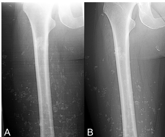
Figure 1. The right thigh before the start of anticoagulant therapy (A) and after 6 years of warfarin treatment (B).

As the ossification process seemed to be progressive, a trial was done with high-dose etidronate.