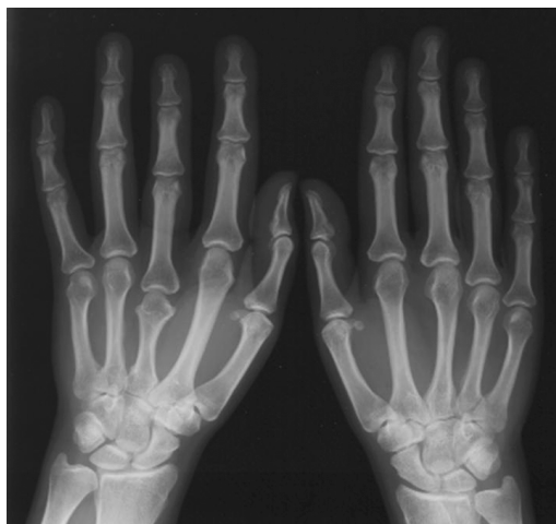
Figure 3. A short third metacarpal bone.

As the acquired form of heterotopic ossification is most frequently provoked by trauma (Vanden Bossche and Vanderstraeten 2005), bleeding might be an important precipitating factor (Vas et al. 1981) and appears to have initiated the process in