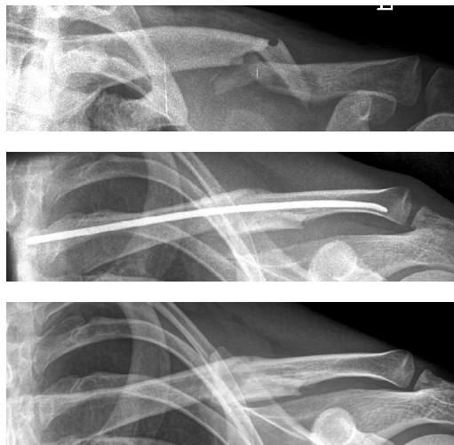
Figure 3. Displaced midclavicular fracture in a 27-year-old man (upper panel). Correct healing after elastic stable intramedullary nailing (middle panel) and radiograph after implant removal (lower panel).

The mean DASH score in the 87 patients was 6.9 (0–43) points (Figure 2). Only 6 patients had a DASH score result of over 10 points, due to restriction in their activities of daily living. The self-evaluated Constant score indicated a good overall result with an average of 84 (46–100) points. On average, inability to work lasted 3 weeks. 81 of the