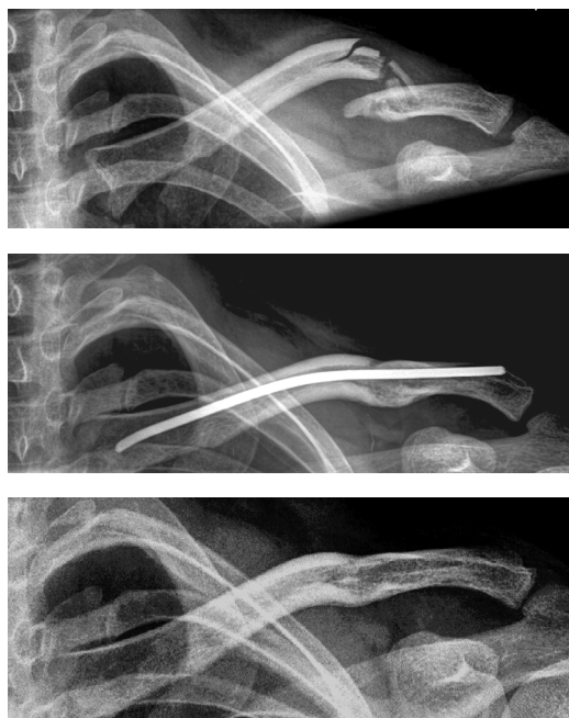
Figure 4. Lateral nailing (ESIN) of a displaced fracture in a 32-year-old man (upper and middle panels) and after implant removal 5 months later (lower panel).