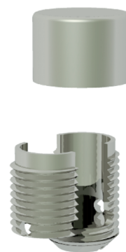
Figure 1. The bone ingrowth chamber. The chamber consists of two threaded half-cylinders held together by a cylindrical closed screw cap. 4 round ingrowth openings are located at the endosteal level.

Cancellous allografts were obtained from the sternum of 6 donor goats. Familial bonds between