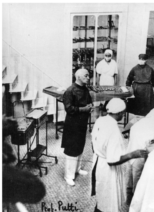
Figure 1. Professor Vittorio Putti in operating room.

By digitalizing the content of the Rizzoli Orthopaedic Institute Library, a census of Vittorio Putti's scientific work could be carried out.