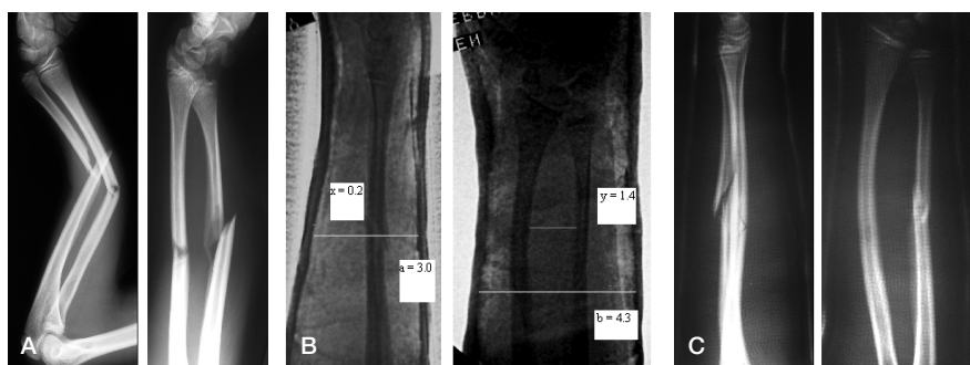
Figure 3. A. Fractures with 100% displacement. B. After reduction, with cast index a/b = 0.69 , padding index ( x/y ) = 0.14, and Canterbury index = 0.69 + 0.14 = 0.83 . C. After 3 weeks, showing no re-displacement.

of maximum deformity correction and “y” is the maximum interosseous distance in the AP view. In an over-padded cast, the value of “x” will increase and so the overall value of x/y will tend to increase and there will tend to be a loss of 3-point fixation of the fracture, as there would be a greater “play” between the plaster cast and the bone, thus rendering the tension on soft tissue at the fracture site ineffective (Figure 2).