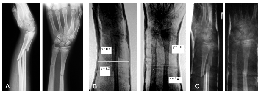
Figure 4. A. Fractures with 50% displacement. B. After reduction, with cast index ( a/b ) = 0.97, padding index ( x/y ) = 0.40, and Canterbury index = 0.97 + 0.40 = 1.37 . C. After 1 week, showing re-displacement.

matched-pairs signed-ranks test and a comparison between the responses of consultants and registrars was made using the Mann-Whitney U test.