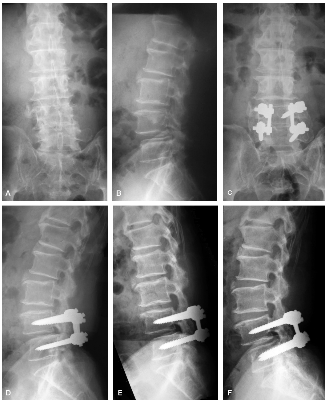
Figure 1. A 67-year-old man. Preoperatively, anteroposterior (A) and lateral (B) views showing degenerative spondylolisthesis at L4/L5. Two years postoperatively, anteroposterior (C), lateral (D), flexion (E) and extension (F) views showed stable implants, solid fusion, and no motion in flexion and extension on stress radiographs.

patients, 71 achieved greater than 25% improvement in ODI scores.