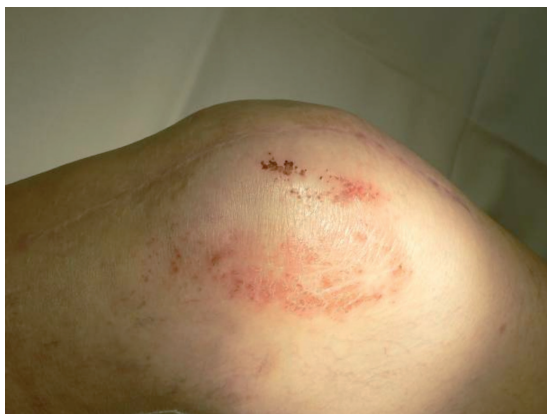
Figure 1. Eczematous reaction after TKA.