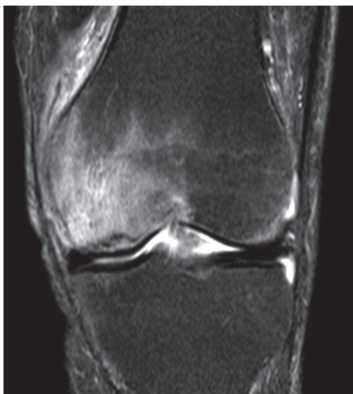
Figure 2. MR image showing bone marrow edema of the medial femur condyle with a focal subchondral lesion typical of osteonecrosis.

In a previous study from the orthopedic department of Lund University Hospital, 40 consecutive patients with scintigraphic and/or radiographic signs of osteonecrosis in one of the femoral condyles were followed for 1–7 years (Al-Rowaih et al. 1991). The size of the lesion correlated with the outcome, and lesions equal to or larger than 40% of the involved femoral condyle in the AP radiograph all had a poor outcome, developing osteoarthritis. We reviewed these 40 patients 20 years later to determine the natural course and long-term consequences of untreated SPONK, in terms of need to undergo major knee surgery with high tibial osteotomy or arthroplasty during the rest of their lives.