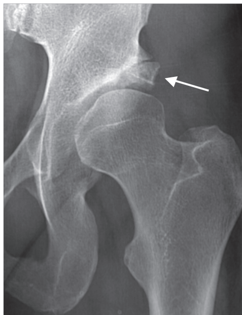
Figure 3. A dysplastic hip, with arrow showing a large os acetabuli or rim fractures.

There is no strong evidence for the optimal treatment of intraarticular pathology together with hip dysplasia (Appendix; see Supplementary data). Most studies pertaining to the treatment of labral tears have been retrospective, and have dealt with FAI (femoroacetabular impingement) cases. These studies have been characterized by limited patient material and only short follow-up. The literature indicates that the labrum should be preserved if possible, and reports have