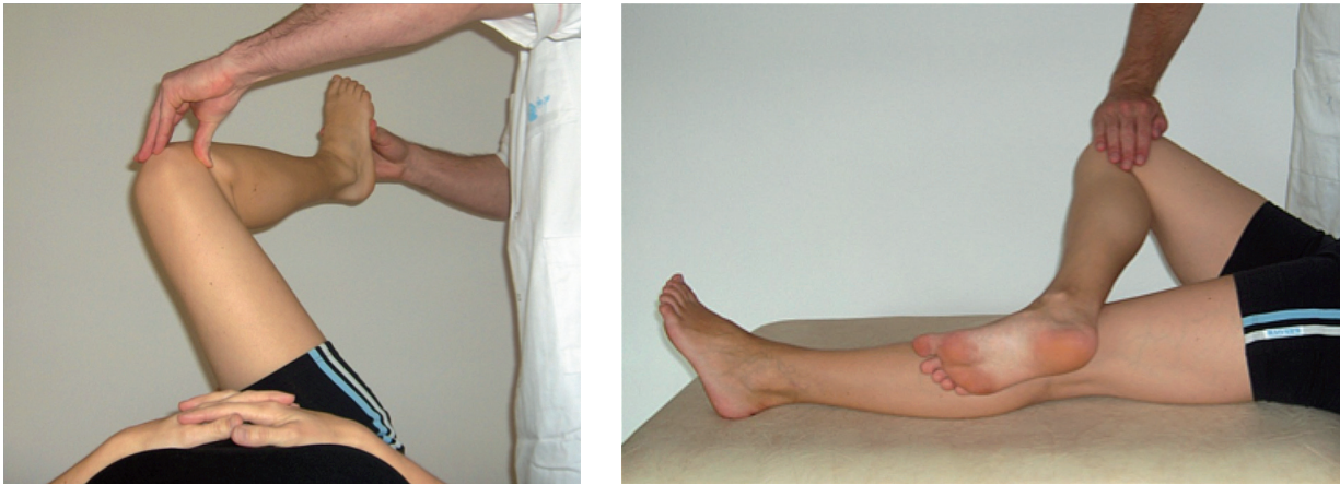
Figure 1. Demonstration of (a) the impingement test, performed by passively moving the hip joint into 90° of flexion, internal rotation, and adduction, and (b) the FABER test. Both tests are considered positive if groin pain is produced (Reproduced with permission from Troelsen et al., Acta Orthop 2009; 80 (3): 314-8).