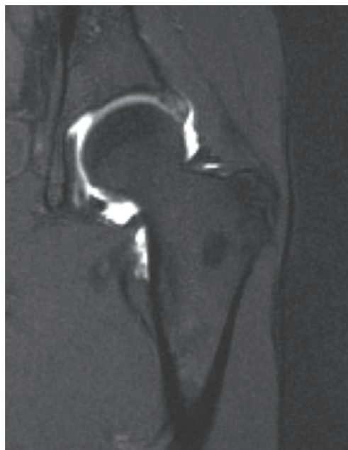
Figure 4. Coronal section MR arthrography of a dysplastic hip. The labrum is hypertrophic and contrast medium is running through the base of the labrum, an indication that the labrum is detached from the acetabular rim.

shown superior outcome if the labrum is refixed rather than excised (Figure 5). By preserving the labrum, continued stability of the hip and the sealing function of the labrum might reduce and delay the development of osteoarthritis in the hip.