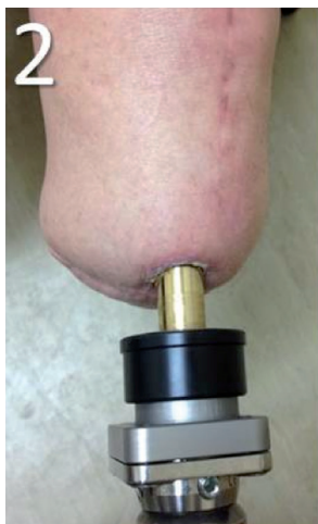
Figure 3. Skin-implant interface for case 2.

degrees. The implants were stable and well aligned (Figure 4C). All patients had complete healing with no discharge at the 3-month follow-up, and none of the cases presented with granulation tissue (Figure 3). Only case 3 had 1 episode of superficial infection and a broken bushing (external abutment).