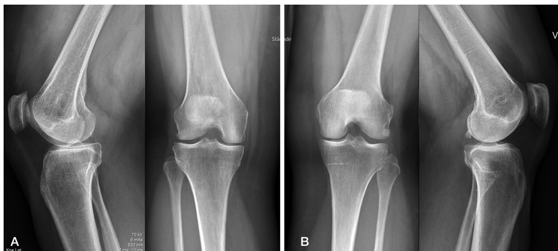
Figure 2. Patient number 5 in the supplementary data table. (A) The right knee with tibiofemoral and femoropatellar Kellgren and Lawrence (KL) grade 2/osteophyte. (B) The left knee with tibiofemoral KL grade 1 and femoropatellar KL grade 0.